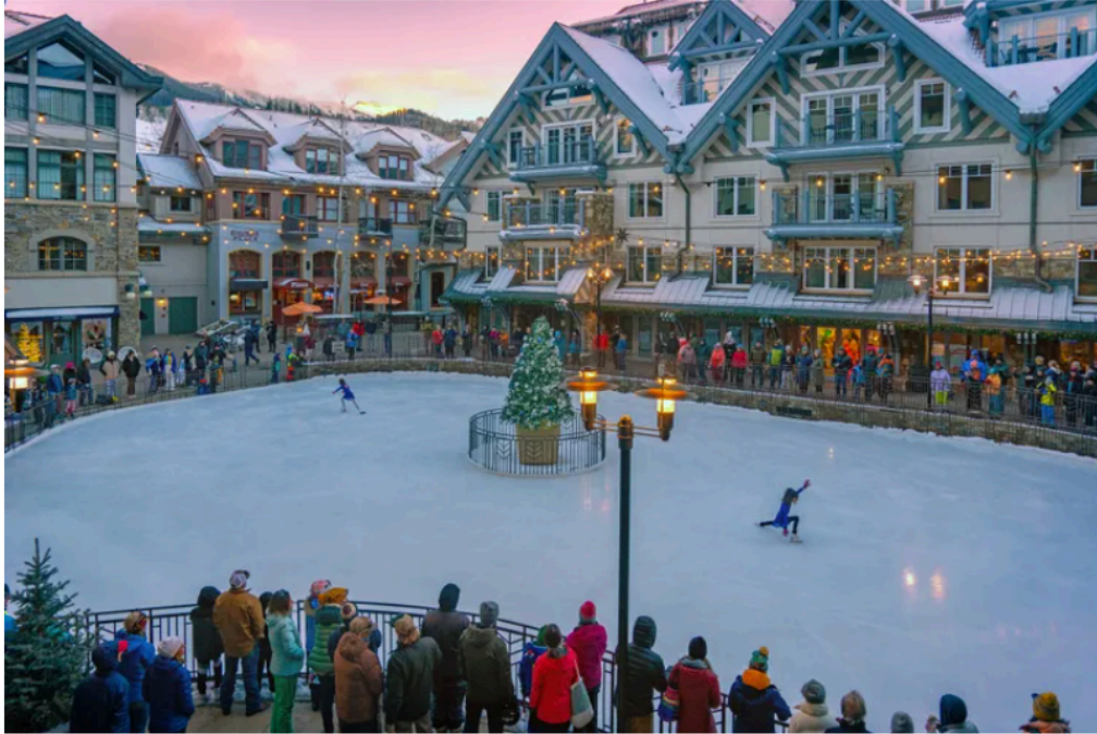
An ice skating rink in Telluride's Mountain Village.

"People often think of Telluride only for its world-class skiing and some of the finest-groomed runs in North America, but the town's rich history, extraordinary beauty, and authentic, close-knit community create an exceptional year-round lifestyle," says Fandel, who describes the ski town as a "high-alpine environment" with "nearly 300 days of annual sunshine." Like most ski towns, Telluride isn't cheap; in fact, it was named the most expensive ski town in the U.S. in 2024.