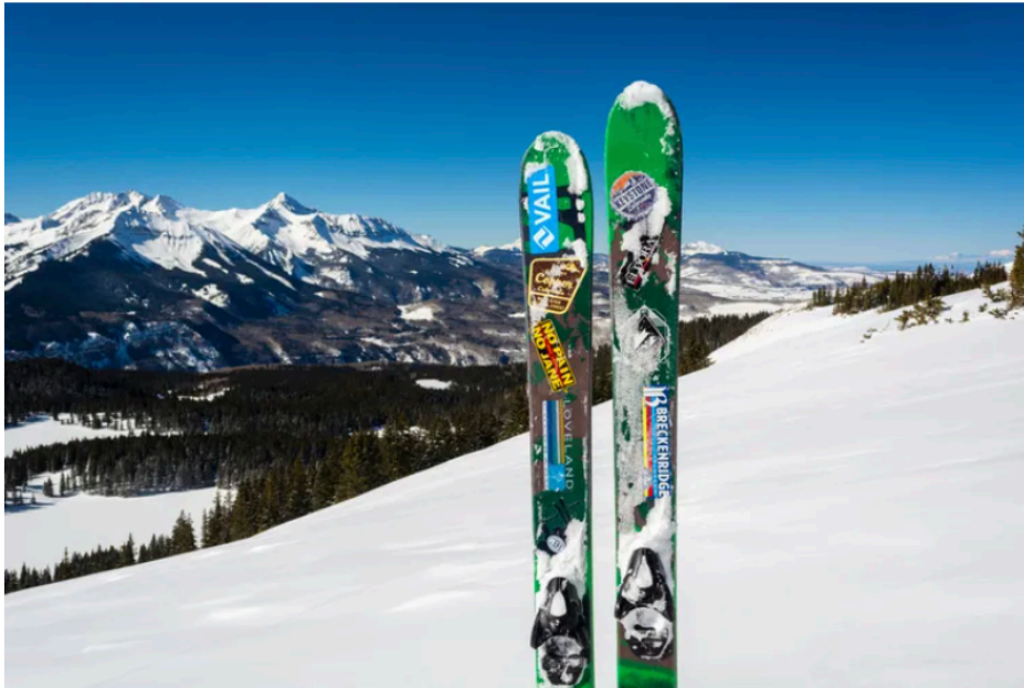
Skis sticking up from the snow.

Life in an American ski town is defined by a few things: access to a ski area, of course, a generally laid-back atmosphere, and a community that shares an appreciation for the outdoors.